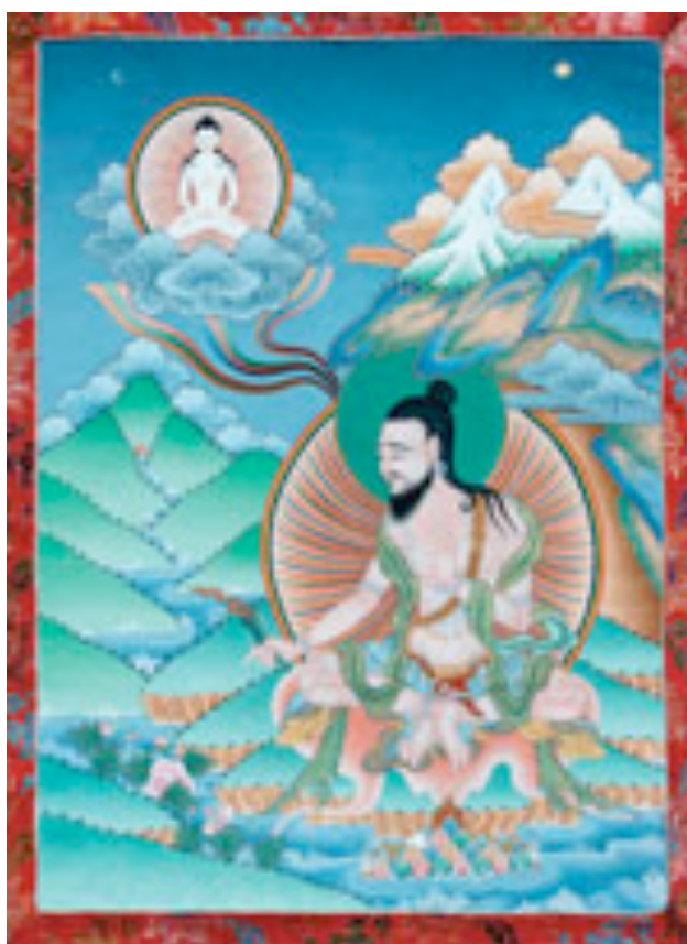
Figure 2 : Gyer spungs chen po sNang bzher lod po in the moment of achieving the supreme realization after which he spontaneously composed the prayer to Ta pi hri tsa.

[all] other sentient beings, who are still caught up in their ignorance, remain behind in samsara. However, we have not abandoned them. Because we are now fully and permanently in the Natural State, the virtuous quality of the great compassion for all sentient beings, which is inherent in it, manifests spontaneously and without limitations. This compassion is total, the great compassion, because it is extended to all sentient beings impartially. And by virtue of the power of this spontaneous compassion, we reappear to Samsaric beings as a Body of Light in order to teach them and help guide them along the path to liberation and enlightenment. 86